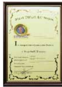
Eurotrade Best of Taiwan's Best Awards