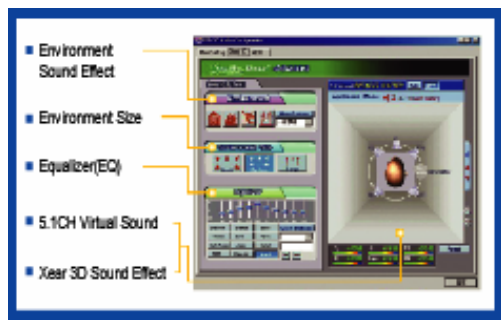
Xear 3D technology

Just plug the speaker and get started. The speaker is fully compliant to USB 1.0/2.0 standards, don't bother seeking outlets for the annoying adapter. With user-friendly driver installation, you've been ready for the unlimited VoIP surfing!